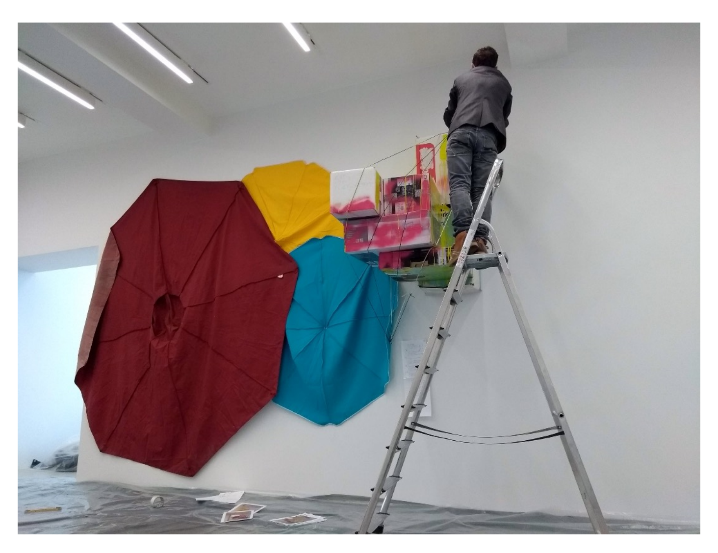
Knut Eckstein, "I'm notreallyinterested in anythinggreaterthanlife", Akureyri Art Museum, Gallery 02. (24/11/2019)

"I'm notreallyinterested in anythinggreaterthan life" was presented in two stages, the final version unveiled in a sweeping performance held in Akureyri Art Museum on the 26th October 2019. In a dynamic show, the artist took his floor-centric work and brought it up onto the dividing wall, transforming the dialogue within the space. In this second instalment, spectators witnessed Eckstein mount three parasols, as well as erect his signature cantilevered overhang; a gravity-defying structure built using only cardboard boxes, tape and clotheslines. Drawing on the architectural philosophies of Frank Lloyd Wright and Le Corbusier, he orchestrated a spirited subversion of balance, both structurally and aesthetically, one which served to counter the instability of the terrain below. The cantilever, a style which takes materials and dances them to the point of near-failure, stands as an architectural beacon of unconventionality and dare. A dual ethos invoked by Eckstein, who not only designed an unorthodox structure, but turned the act into a dauntless performance. "I wanted to go beyond borders, beyond what I've done before," says the artist. "I wanted to push myself in front of the abyss."